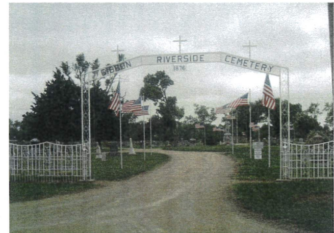
Open dawn to dusk

Gibbon Riverside Cemetery Navaho & 85th Road Gibbon, NE